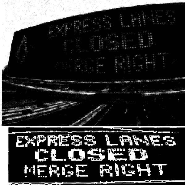
Figure 1. CMS Verification on HOV Lanes