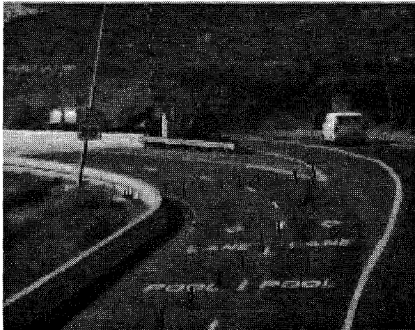
Figure 2. Pop-up Barrier Verification on HOV Lanes